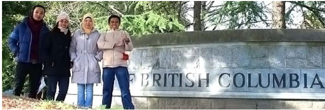
AIT students at UBC