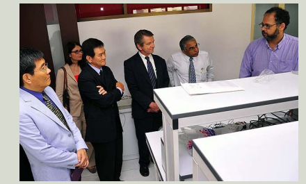
AIT delegation at the Bangkok University.

A senior delegation from AIT visited Bangkok University on 18 March 2014 to tour its facilities and discuss areas of potential partnership. The AIT delegation was led