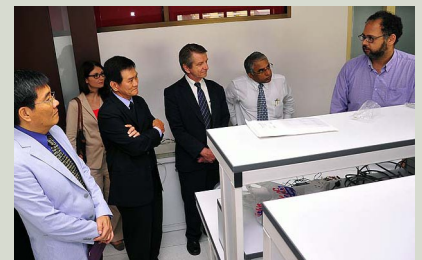
AIT delegation at the Bangkok University.

A senior delegation from AIT visited Bangkok University on 18 March 2014 to tour its facilities and discuss areas of potential partnership. The AIT delegation was led