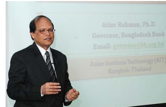
Dr. Atiur Rahman

Bangladesh Bank Governor Dr. Atiur Rahman says inclusive financing and environmentally friendly 'green' banking is the answer to bringing financial