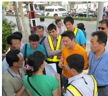
DPRK officials at the AIT training program.

Ten engineers and transport officials from the Democratic People's Republic of Korea participated in a UNESCAP-supported training program on "Road Safety and Traffic Man-