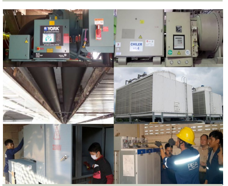
FIRST CAMPUS BACKBONE OVERHAUL IN 45 YEARS