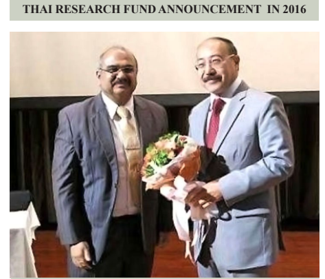
INNOVATIVE INTEGRATED BACHELOR-MASTER PROGRAM PURSUED