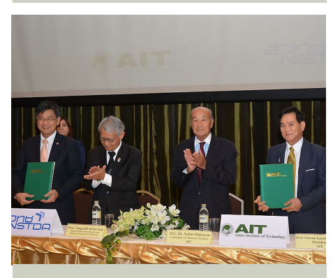
STRENGTHENING LOCAL PARTNERSHIPS