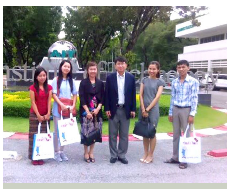
EMBARKED ON INDUSTRIAL FUNDING