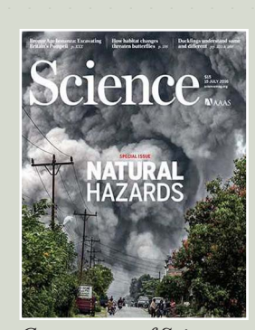
Cover page of Science

Till a few years ago, very few specialists were working on the analysis and use of satellite images. However, for the past 15 years, a niche area has developed of those experts who are using satellite data for disaster management. Tracking