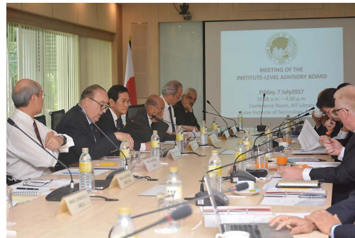
ILAB meeting at AIT.