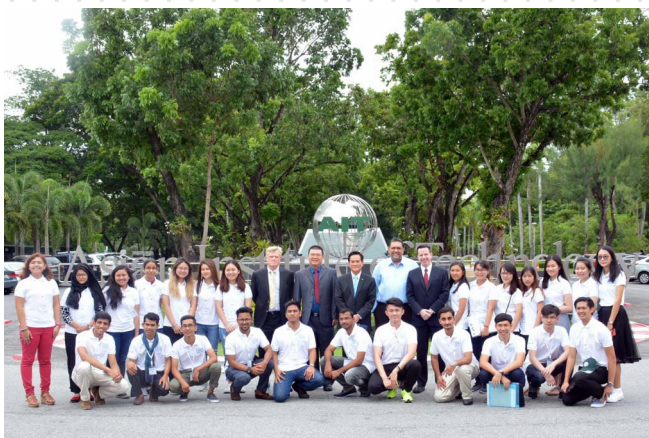
AIT-Tiger Leong camp participants.