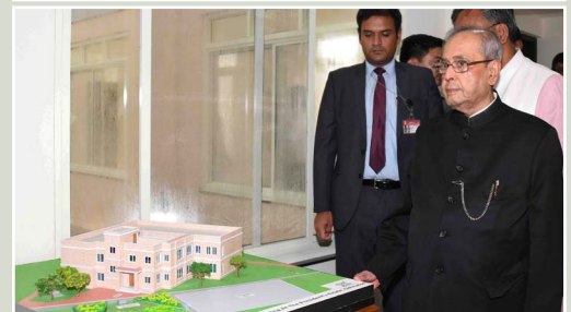
Top: Certificate of Appreciation. Bottom: Former Indian President Pranab Mukherjee inaugurating the “Ashiana Annexe.”