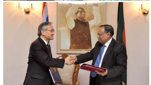
Thailand's Foreign Minister Mr. Don Pramudwinai and Bangladesh Prime Minister H.E. Sheikh Hasina Wajed (top) and Foreign Minister A. H Mahmood Ali (bottom).