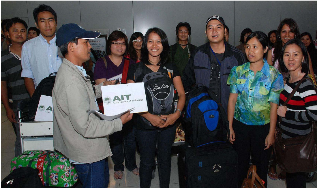
AIT welcomes students at the Suvarnabhoomi Airport at Bangkok.