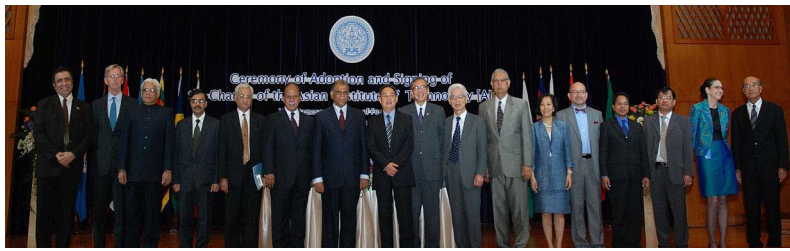
File photo: The signing ceremony of AIT's New Charter.

The new AIT Charter will come into force from 30 January 2012. This was stated by the Chairman of the Board of Trustees of AIT, H.E. Dr. Tej Bunnag during the special meeting of the Board of Trustees held on 22 November 2011. This follows the submission of the fifth Instrument of Acceptance by the Government of Pakistan on 29 July 2011.