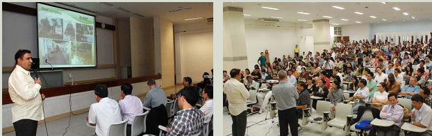
Institute Forum at AIT's temporary campus.