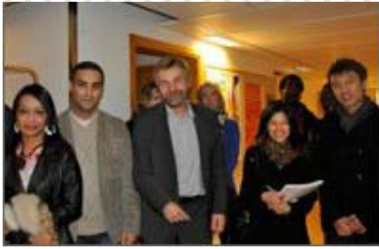
University of Borås students launch fund raising drive

Students from University of Borås, Sweden, have launched a fund raising drive for helping rebuild the flood ravaged AIT. Recognizing that AIT is a partner Institute of the University of Borås, a group of students have launched a drive asking everyone to visit the AIT website ( http://www.ait.asia/support.php ) and contribute to AIT.