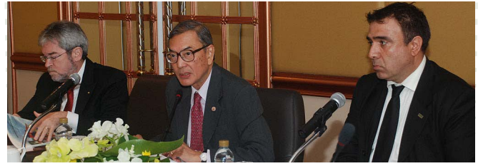
Meeting of the AIT Board of Trustees held on 22 November 2011.