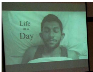
Screenshot of one of the videos.

From the swimming pool to the laboratory; from the endless assignments and tests to playtime; and from late study hours to the international culinary delights at AIT - these were some of the aspects about campus life covered by AIT students in the videos screened at the AIT Short Film Festival.