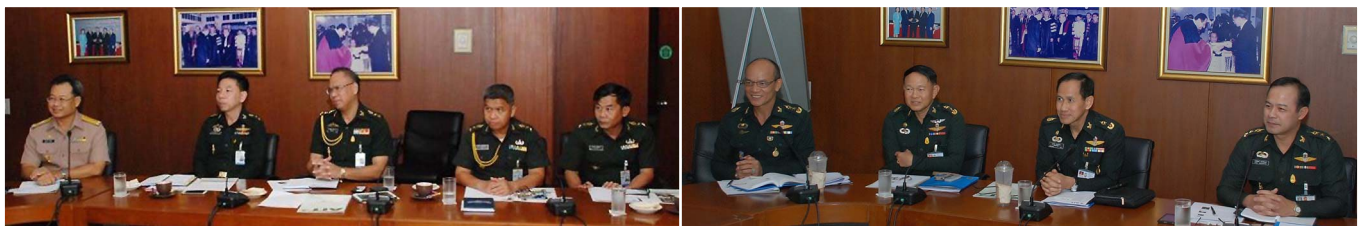
Delegations from MRDC and NDC.

Two senior military delegations from the Thai Military Research and Development Centre (MRDC), and the Thailand National Defence College (NDC) visited AIT in November seeking collaboration with AIT.