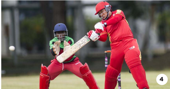
1. Career Fair 2. Research Exhibition 3. Open House 4. International Women's Cricket Match.