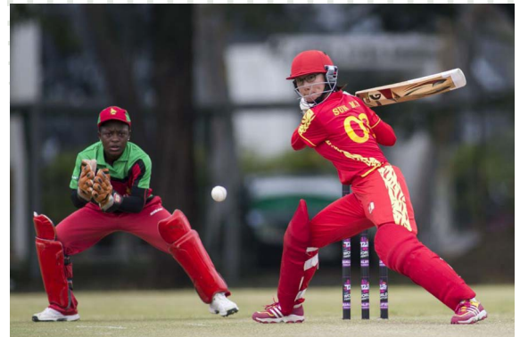
China play Zimbabwe at AIT.

Four qualifying matches between Ireland and Scotland, China and Zimbabwe, Bangladesh and Scotland, Thailand and Papua New Guinea have already been played. Two more qualifying matches, two Shield Semi-Finals, besides the Shield Trophy and playoff for the third position will also be at AIT.