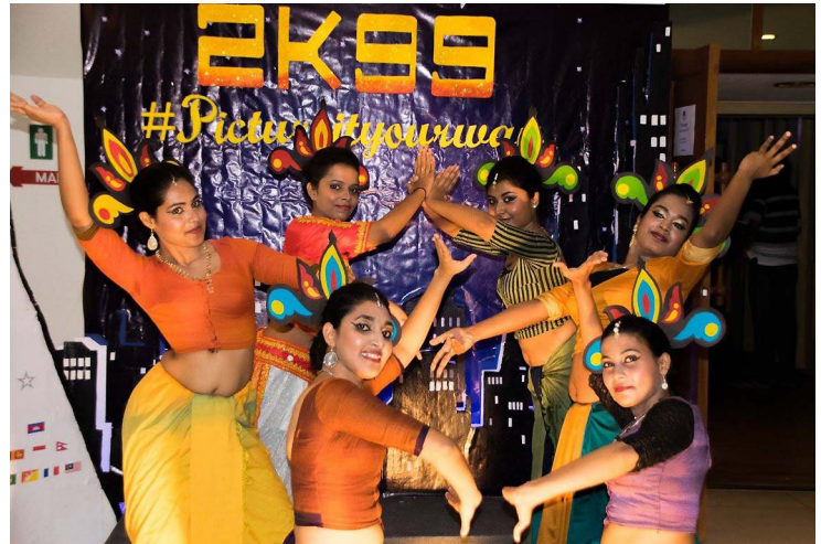
AIT Cultural Show.

AIT's international orientation, academic and research excellence and welcoming atmosphere were all on display during November as the Institute hosted five mega events - Cultural Show, Career Fair, Research Exhibition, Open House, and ICC Women's World Twenty20 Qualifier Cricket Tournament.