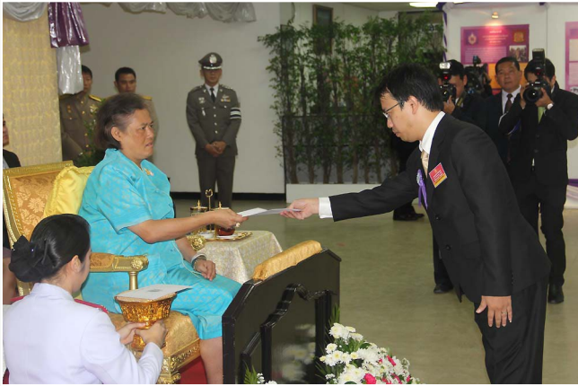
Her Royal Highness Princess Maha Chakri Sirindhorn bestowing a token of appreciation to AIT.