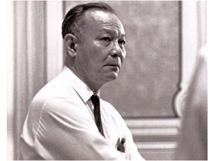
Dr. Puey Ungphakorn

United Nations Educational, Scientific and Cultural Organization (UNESCO) will celebrate the birth centenary of Dr. Puey Ungphakorn, first Chairman of the AIT board of Trustees. His birth centenary falls in 2016. The resolution for celebrating Dr Puey's 100th birth anniversary was accepted at the 38th General Conference of UNESCO held on 2 November 2015.