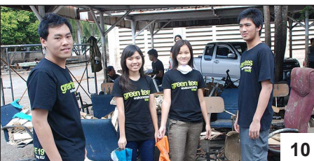
1-7: AIT Orientation 6 December 2011 8-10: AIT Cooperative Clearing Days 10-11 December 2011