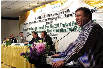
AIT President at the seminar

Experts from various streams suggested remedial measures and emphasized the need to learn lessons from the Thailand flood. At a seminar on “Lessons learned from the 2011 Thailand Flood Disaster and Future Directions for Flood Prevention and Mitigation,” organized by AIT and ASEAN Affairs in association with the Center for Advanced Infrastructure Technology (CAIT), University of Mississippi, panelists stressed the need for knowledge sharing, capacity building, and preparedness.