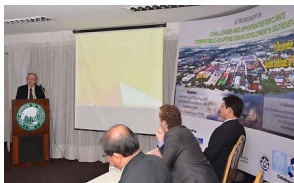
Workshop proceedings at AIT.

“Vulnerability and Adaptation to Climate Change in Coastal Cities of Southeast Asia,” a 4-year, 3-country focused research project conducted by AIT and funded by