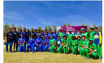
India and Pakistan teams in the finals

The lush grounds of the Asian Institute of Technology (AIT) were host to Women’s Asia Cup Twenty20 tournament played from 25 November-4 December 2016, making history in the cricketing world in Thailand. The final match between India and Pakistan was telecast live, and Thailand became the first country to live telecast a game of Women’s Asia Cup.