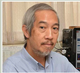
Prof. Pennung Warnitchai

More details are available at this link: https://goo.gl/n6EoSj