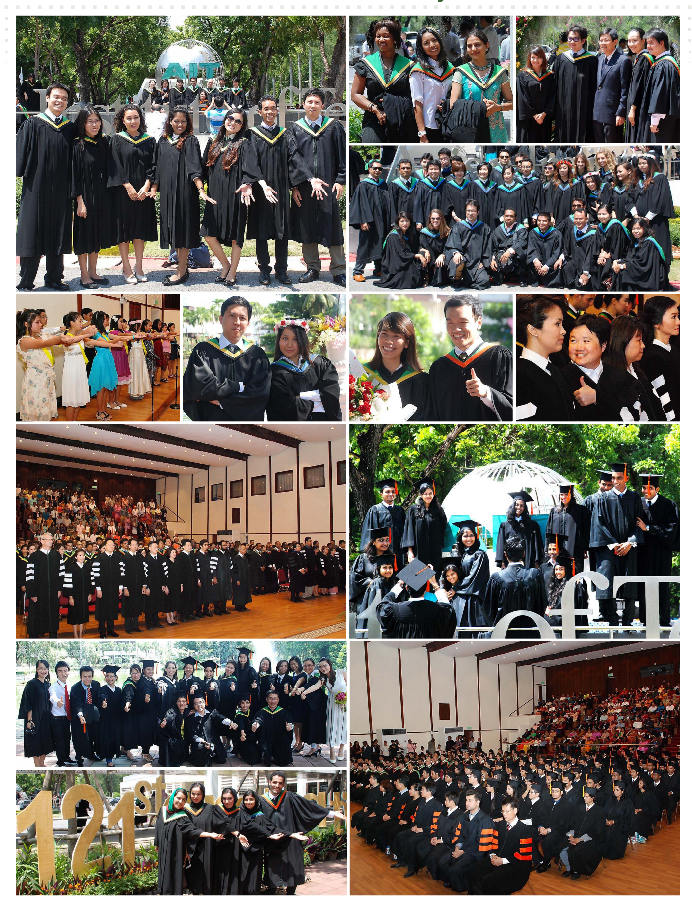
121st Graduation: 23 May 2014