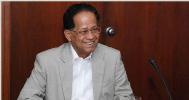
H.E. Mr. Tarun Gogoi

The Chief Minister of the Indian state of Assam, H.E. Mr. Tarun Gogoi expressed interest in collaborating with AIT to address a number of priority concerns for his state, particularly in the areas of education and sustainable socioeconomic development. High on the state gov-