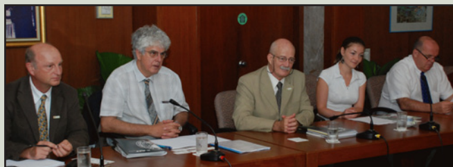
CIRAD delegation at AIT