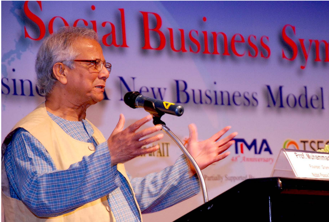
Prof. Muhammad Yunus at the Social Business Symposium.