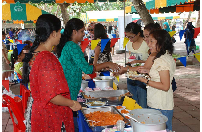
AITIS Food and Fun Fair.