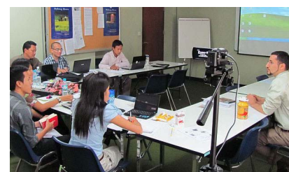
MRC participants at AIT.

merses the trainees in interactive skills-based class instruction in reading, grammar, speaking, and writing and vocabulary development, while injecting necessary real-world assignments into the curriculum.