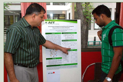
SU Research Poster Showcase 2012

AIT is a research-focused institute brimming with students eager to present their latest work to the public. At the inaugural SU Research Poster Showcase on 29 May 2012 young AIT researchers did just that,