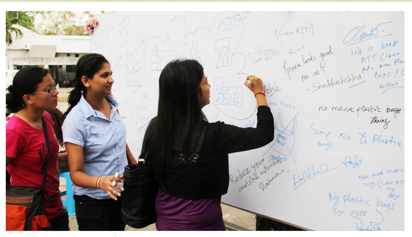
AIT Students sign up for a sustainable campus.