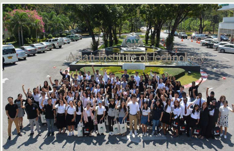
Open House participants.

It is important to engage in lifelong learning and to acquire knowledge at every stage in life. Lifelong learning has assumed increased importance since what we learn today