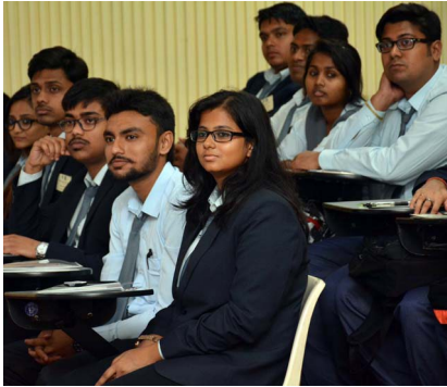
AIT Study Tour from 2-15 February 2017 for students of JIS group, India.