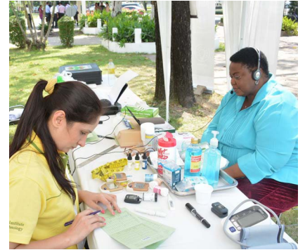
Demonstration of Pro-poor Telemedicine Technology by AIT Extension.