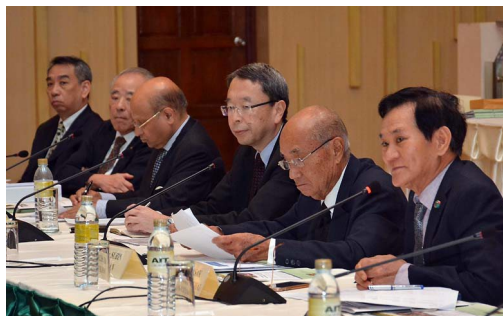
PPP Interaction session at AIT.

Led by Ryuichi Kage and Amir J Qari of the ADB, the interaction session highlighted how the ADB has established a dedicated Office of Public-Private Partnership (OPPP) to support and enable governments to secure greater private investment and generate economic growth in the region.