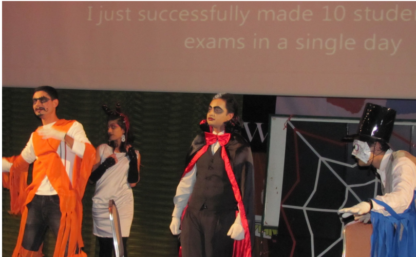
The team from Nepal in the drama competition.

As the lights dimmed and the spotlight shone, a bevy of AIT’s finest performing artists took to the Conference Center auditorium stage on 1 April 2011 to sing, dance and entertain for the sheer love of performance and to show solidarity for the victims of the recent catastrophe in Japan.