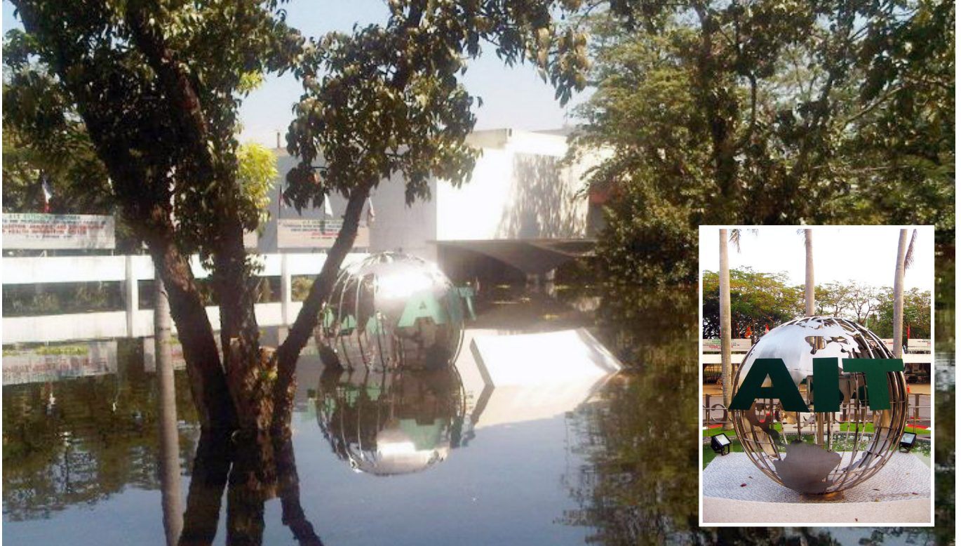
AIT landmark now and then (inset)