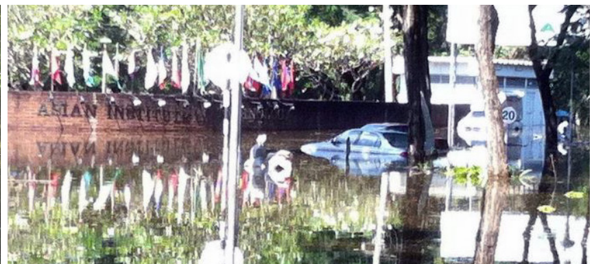
The AIT entrance