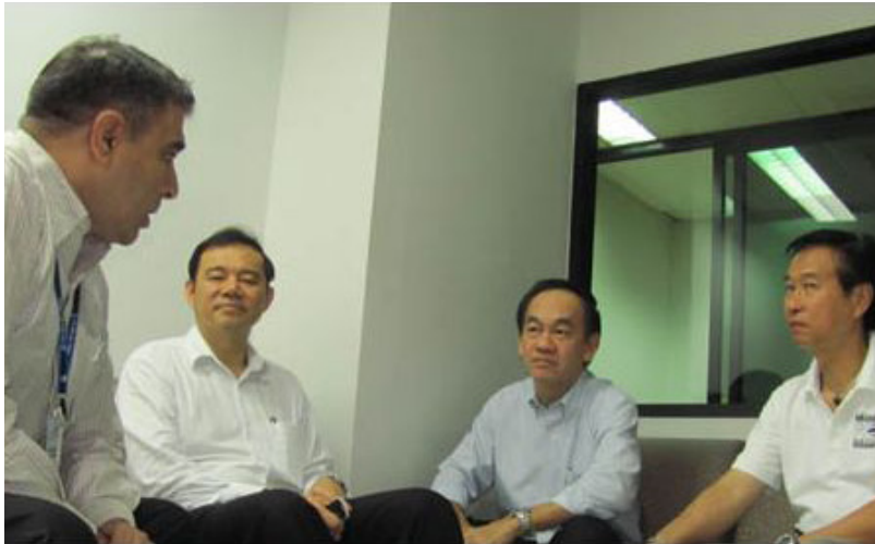
AIT Alumni officials visit Bangkok office