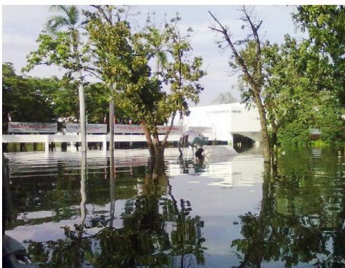
AIT's Conference Center