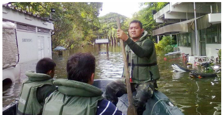
The Royal Thai Army patrols in boats where people used to walk.