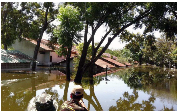
Faculty housing within AIT campus