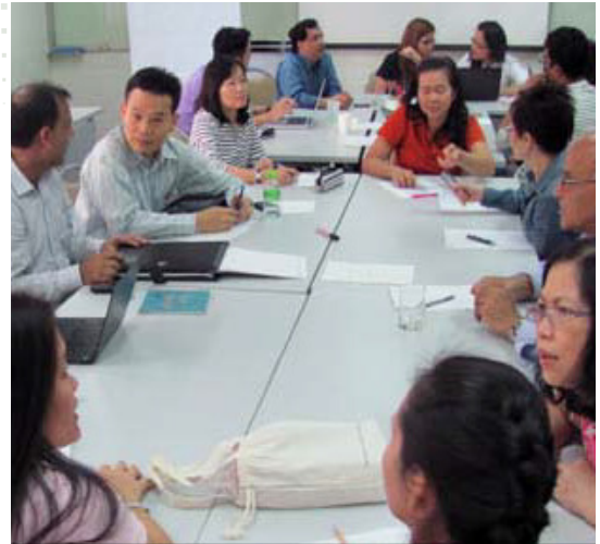
Scene from AIT's temporary office in Bangkok

Within four days of its mother campus in Pathumthani facing unprecedented inundation, AIT began operations from a temporary office in central Bangkok. The office is located at the training headquarters of AIS Corporation, at 414 INTOUCH Tower 1, 25th Floor Phaholyothin Rd, Soi 8 (Sailom) - 500 meters north from Ari BTS, Exit 4, Samsen Nai, Phayathai, Bangkok 10400.