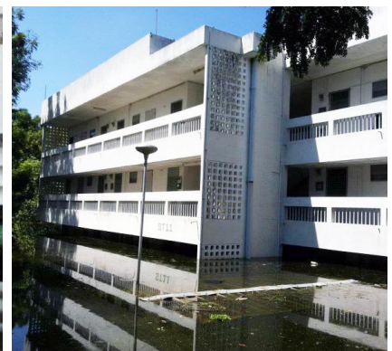
Building of AIT's School of Environment, Resources and Development (SERD). AIT staff housing under water.