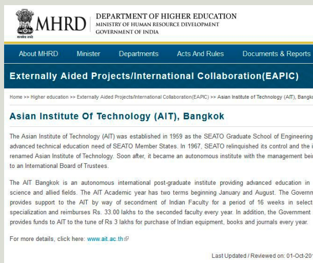
Screenshot of the website of India's Ministry of Human Resource Development (MHRD).

Describing AIT as an "autonomous International postgraduate Institute which provides advanced education in engineering, science and allied fields," the MHRD states that AIT is an autonomous institute with its management being entrusted to an International Board of Trustees. It adds that India's Ambassador in Bangkok is a member of the Board of Trustees of AIT. MHRD also provides support to AIT by way of secondment of Indian Faculty for a period of 16 weeks in selected areas of specialization.