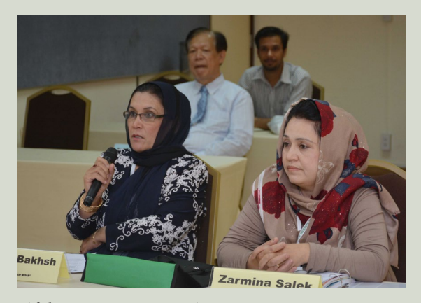
Afghan participants at AIT.

AIT concluded its third batch of capacity building programs for Afghan officials from their Ministry of Energy and Water on 15 October 2015. The program run by the Water Engineering and Management (WEM) field of study at AIT saw three batches of 10 engineers, managers and professionals each learn about various aspects of irrigation projects.