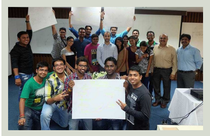
SRMU Education Camp.

AIT played host to a two-week Education Camp and Study Tour for 19 undergraduate students and two faculty members of Shri Ramswaroop Memorial University (SMRU), Lucknow, India.