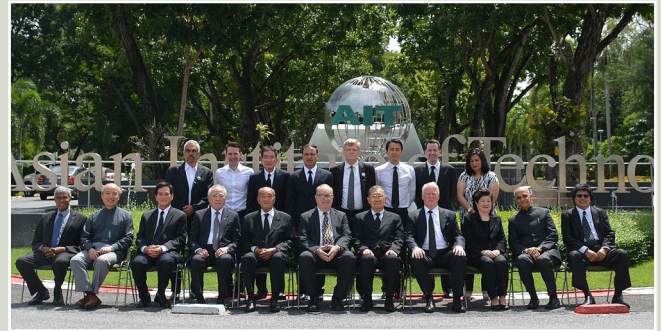
Inaugural meeting of ILAB.