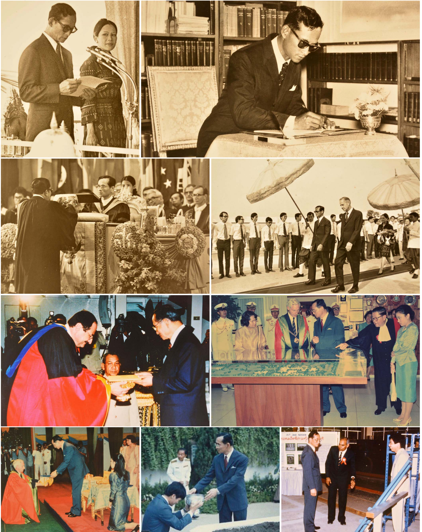
AIT has been blessed with a Royal association with His Majesty King Bhumibol Adulyadej. His Majesty presided over AIT convocations (1968, 1975), and the opening of AIT campus in Pathum Thani (1973). His Majesty graciously accepted AIT's first Gold Medal for Outstanding Leadership in Rural Development (1987), Doctorate in Engineering, and Doctorate in Science (Honoris Causa) in 1975 and 2001 respectively.