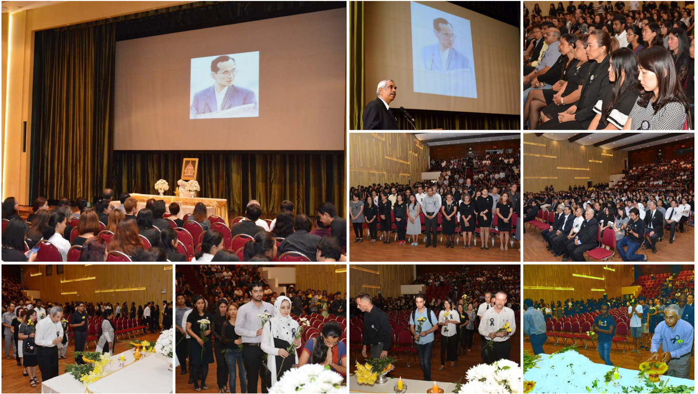
Prayer and Condolence Meeting