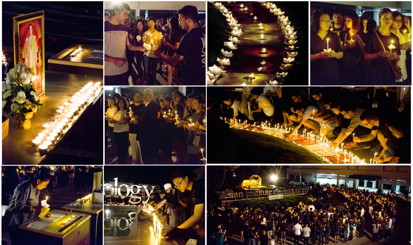
Candle Light Memorial Service