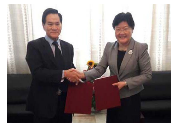
MoU with NPU (top) and Xidian University.

The MoU with NPU was signed on 11 October 2016 during a visit of an AIT delegation during NPU's