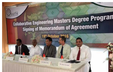
MoA signing with SAITM.

AIT has signed a Memorandum of Agreement (MoA) with the South Asian Institute of Technology and Medicine (SAITM), Sri Lanka, to launch a Collaborative International Master's and Diploma Program.