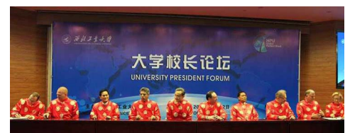
Signing of Xi'an Manifesto

Nine University Presidents from across the globe have signed the "Xi'an Manifesto" with an aim "to propel international exchange and cooperation among the nine universities."