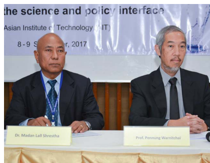
REGIONAL WORKSHOP: Adaptation to Groundwater Vulnerability of Asian Cities to Climate Change 8 September 2017