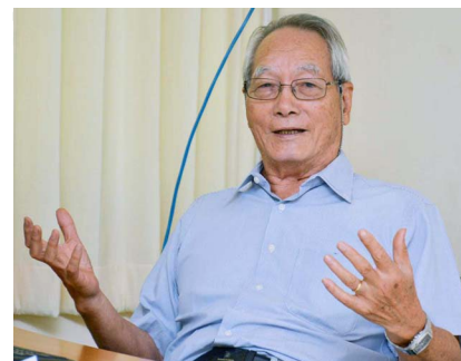
SEMINAR: Aquaculture Ecosystems and Integrated Multi- trophic Aquaculture Prof. C. Kwei Lin 12 September 2017