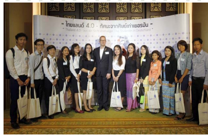
AIT students at the DAAD function.

Fourteen AIT students received certificates on the occasion of the sixtieth-anniversary celebrations of the German Academic Exchange Service-Deutscher Akademischer Austauschdienst (DAAD) held on 10 September 2017.