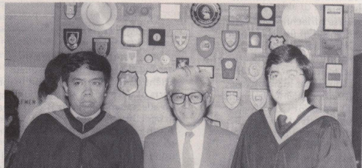
Thirty years ago, AIT celebrated its 50th graduation.