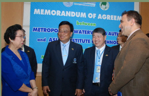
MoA signing ceremony at MWA.