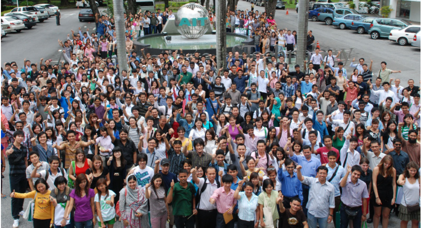
Incoming students at the AIT Landmark on the occasion of Orientation Day.