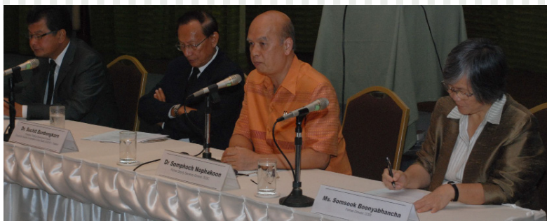
Experts at seminar organized by AIT Extension.