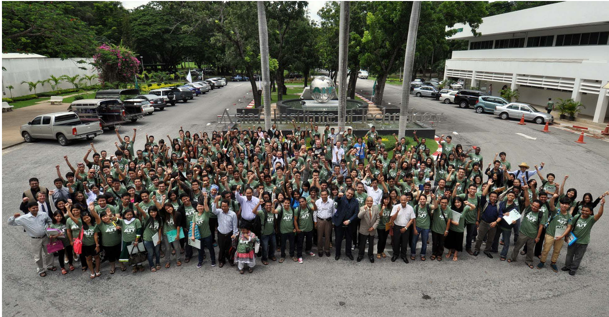
Incoming students of the August 2012 batch.