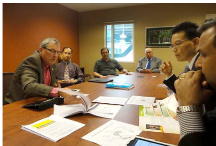
MoU signing ceremony at CSU.

Colorado State University (CSU), Fort Collins, Colorado, USA and AIT aim to develop a joint self-sustaining research program in the field of alternative energy.