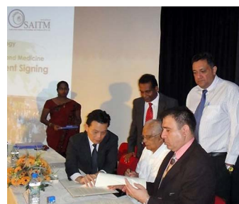
MoU signing ceremony in Sri Lanka.

AIT has signed a Memorandum of Agreement (MoA) with the South Asian Institute of Technology and Medicine (SAITM), Sri Lanka, to launch four-year collaborative international Bachelor’s degree programs in Bio-systems