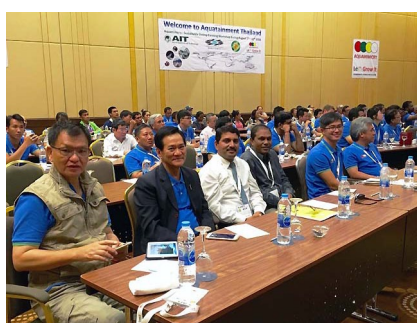
AIT team at the Aquamimicry workshop.

With shrimp farming in Thailand facing considerable challenges in recent years, AIT will be assuming a lead role in research and dissemination of aquamimicry technology.