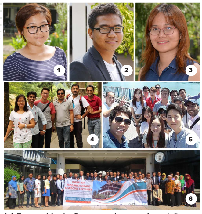
1-3 Erasmus Mundus Panacea exchange students, 4. Summer Program at Ochanomizu University, 5. Internship program in South Korea, 6. KARG Award Ceremonv at Institut Teknologi Bandung (ITB), Indonesia, on 19th August, 2016.

KARG: The KARG (KWEF-AIT Research Grant) Award Ceremony was held at Institut Teknologi Bandung (ITB), Indonesia, on 19 August 2016. Awardees from Thailand, Indonesia, and Vietnam, President of