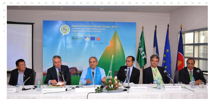
Press Conference at Embassy of France.

COP 21 could be a turning point for humanity if countries are able to achieve a new international agreement aimed at keeping global warming below 2°C. This was the sentiment of various experts, scientists, policy makers and practitioners that had assembled at AIT for the Regional Forum on Climate Change (RFCC) held between 1-3 July 2015.