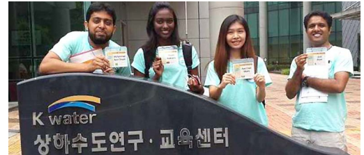
AIT students at K-Water (top) and Hydro-Asia 2015 (bottom).