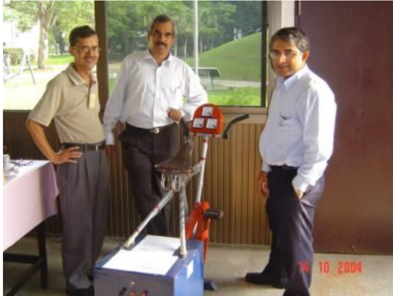
A Pedal Power Pack developed by Renewable Energy Technologies in Asia Project