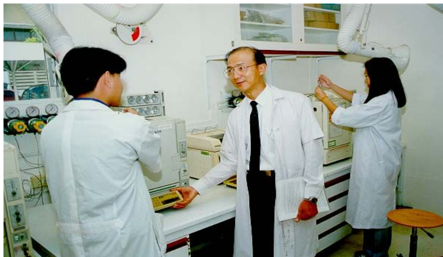
Phyto-Bioremediation for VOCs at Contaminated Site Project

Research carried out by AIT as part of Sustainable Solid Waste Landfill Management project under ARRPET