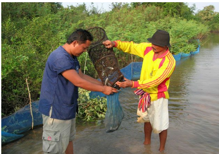
Wetlands Alliance Program