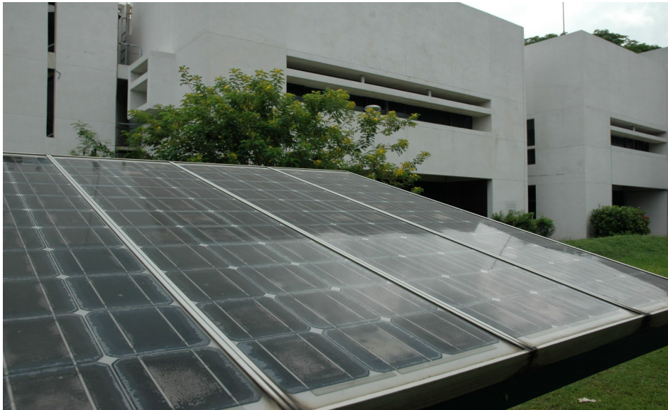
Asian Regional Research Programme in Energy, Environment and Climate