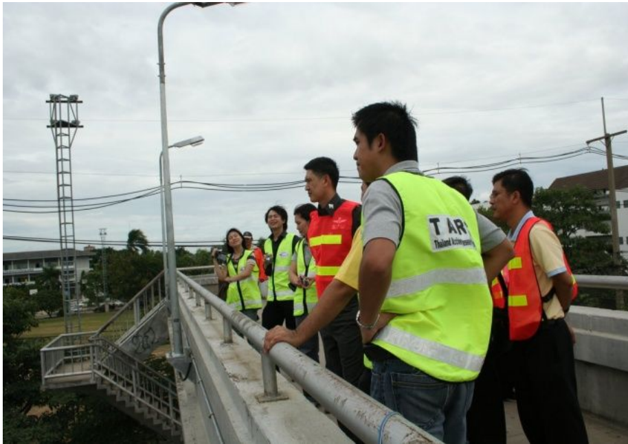
Thailand Accident Research Center Field Visit