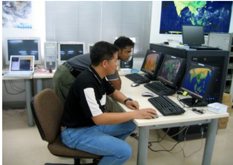
Capacity Building in Poverty Mapping in ASEAN Project