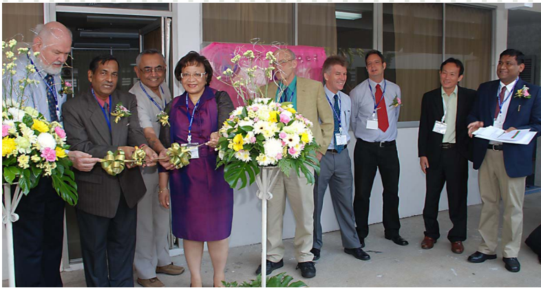
Inauguration of ACISAI.

Scientists at AIT are set to introduce a “more intelligent pathway” for cultivating rice in Thailand, Laos, Cambodia and Vietnam through sustainable agriculture development and System of Rice Intensification (SRI) following the grant of a five-year Euros 3.4 million project by the European Union.