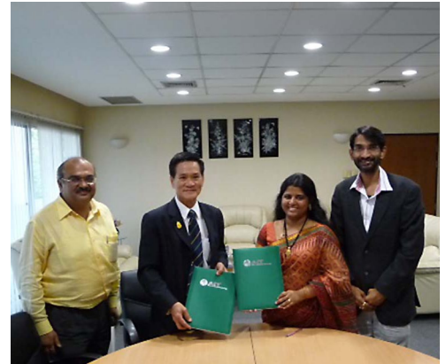
The signing ceremony at AIT.

Seventy-three students will arrive from the Jawaharlal Nehru Technological University Kakinada (JNTUK), Andhra Pradesh, India to AIT in August 2014 to pursue a Master’s degree under the expanding Unified Program.