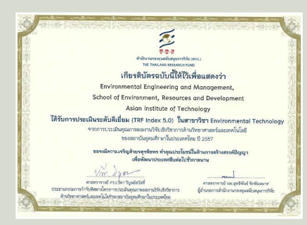
Scanned copy of TRF's Grand Award to AIT for securing the most perfect scores.