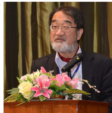
Prof. Akimasa Sumi

Amidst the backdrop of the adoption of Sustainable Development Goals (SDGs) by the United Nations, and the signing of the Paris Agreement on Climate Change under the aegis of the United Nations Framework Convention on Climate Change (UNFCCC), the Regional Resource Centre for Asia and the Pacific