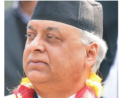
Madhav P Ghimire

Mr. Madhav P. Ghimire, an alumnus of AIT, has been appointed as Minister of Home Affairs and Minister of Foreign Affairs in Nepal's interim government.