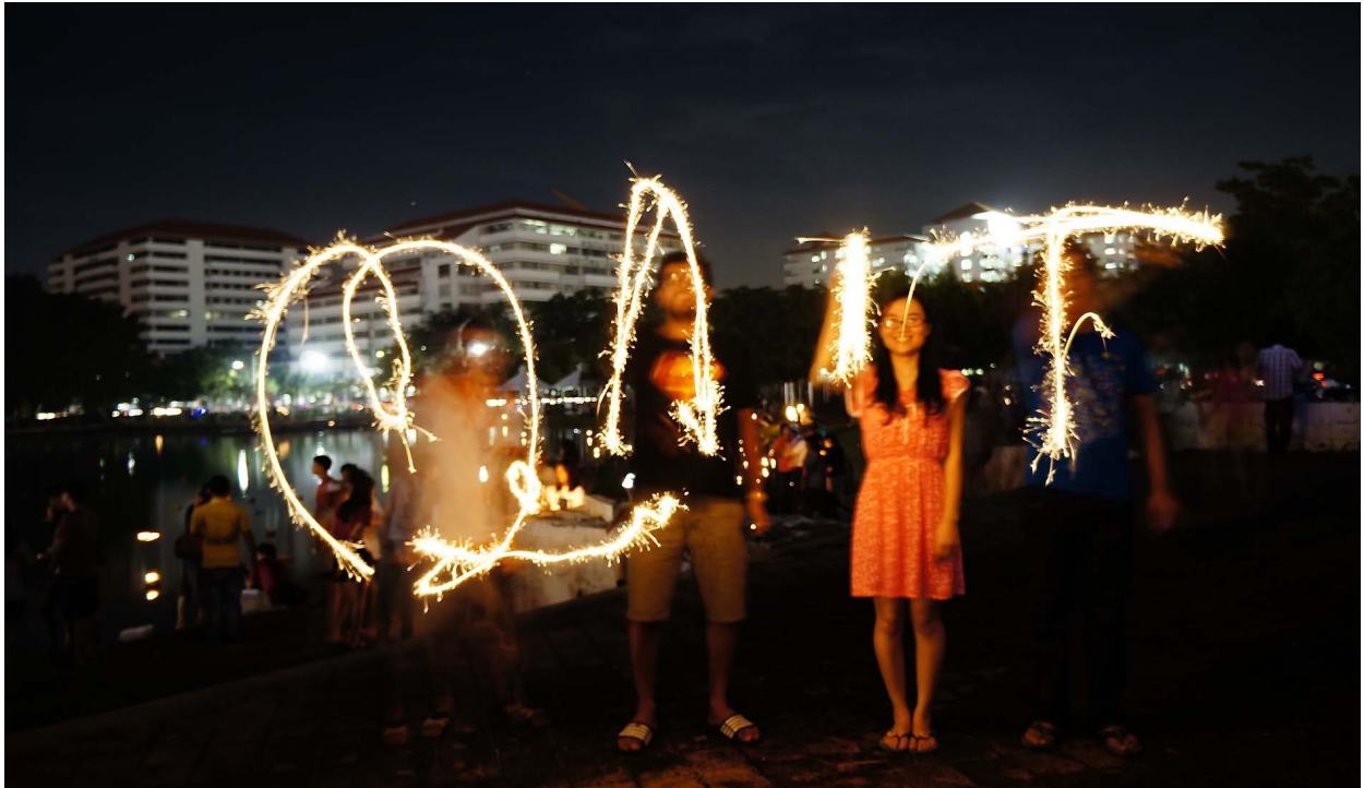
One of the winning entries at the AIT Photography Competition.