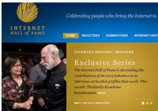
Screenshot of Internet Hall of Fame homepage.