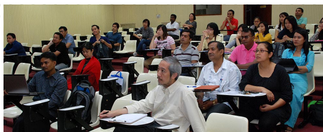
Audience at the DPMM seminar.

Five students from the Disaster Preparedness Mitigation and Management (DPMM) field of study shared their experience about the impact of the 2011 Great East Japan Earthquake and Tsunami, and Coastal Disaster Management based on their study trips to Japan. These students were associated with the Disaster Resilient Countries (DRC) and Intensive Programme on Sustainability (IPoS) programs.