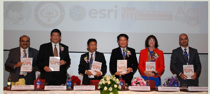
Release of healthGIS 2013 commemorative volume.

The “5th International Conference on health-GIS 2013” hosted and co-organized by AIT on 21-22 August 2013, highlighted AIT’s leadership in GIS and Remote