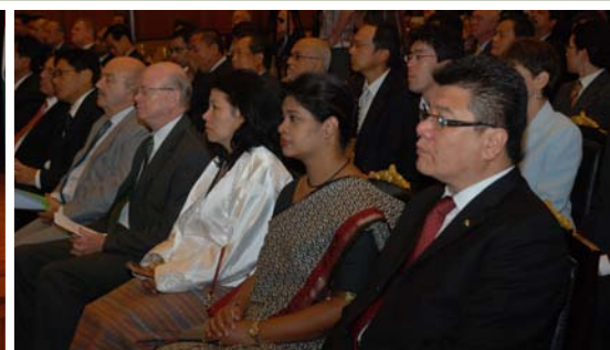
Galaxy of dignitaries at the signing ceremony of the new AIT Charter.