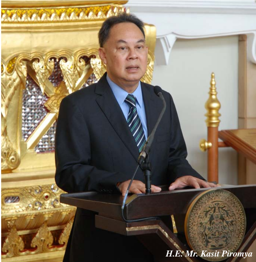
H.E. Mr. Kasit Piromya