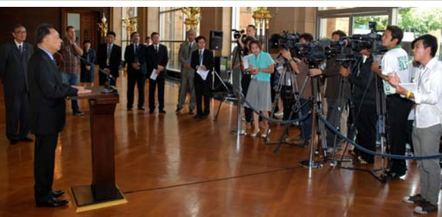
Foreign Minister H.E. Mr. Kasit Piromya addressing a press conference after the signing of the new AIT Charter.