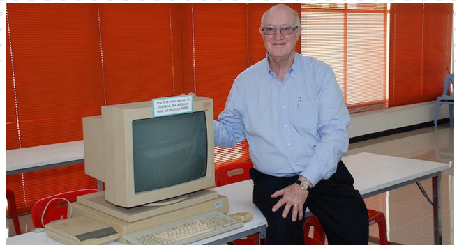
Dr. Steve Crocker