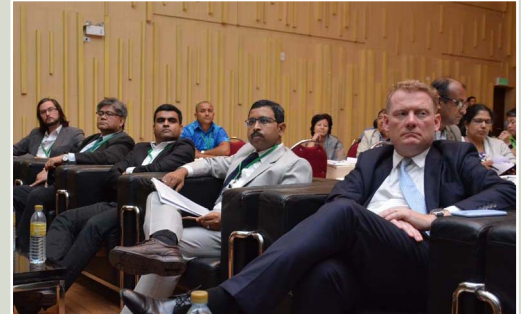
Delegation at Mainstreaming Resilience and Disaster Risk Reduction in Education.