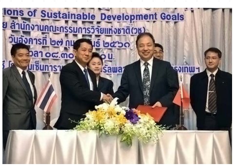
Inauguration of Digital Belt and Road International Center of Excellence (DBAR ICoE-Bangkok).

AIT is among the organizations that will support the China's Digital Belt and Road (DBAR) program following the establishment of the Digital Belt and Road International Center of Excellence (DBAR ICoE-Bangkok). The establishment of the Center was officially announced on 27 February 2018 by the National Research Council of Thailand (NRCT) along with the Chinese Academy of Sciences (CAS).