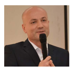
Industry's 4.0 Challenges for the Industrial Engineering Curricula