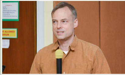
Seminar on Trade Data Analytics: Case Studies at the Global, National, and Transaction Levels