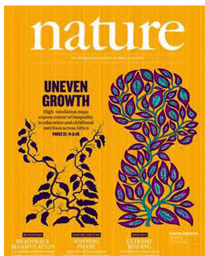
Cover of the 1 March 2018 issue of Nature