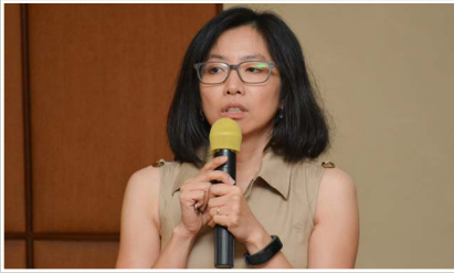
Seminar on Cryptography Basics for Understanding Bitcoin and Blockchain Technology