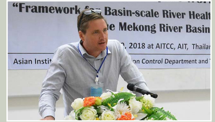
International Expert Workshop on Framework for Basin-scale River Health Assessment in the Mekong River Basin