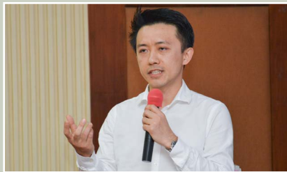
Seminar on How Blockchain can disrupt our lives