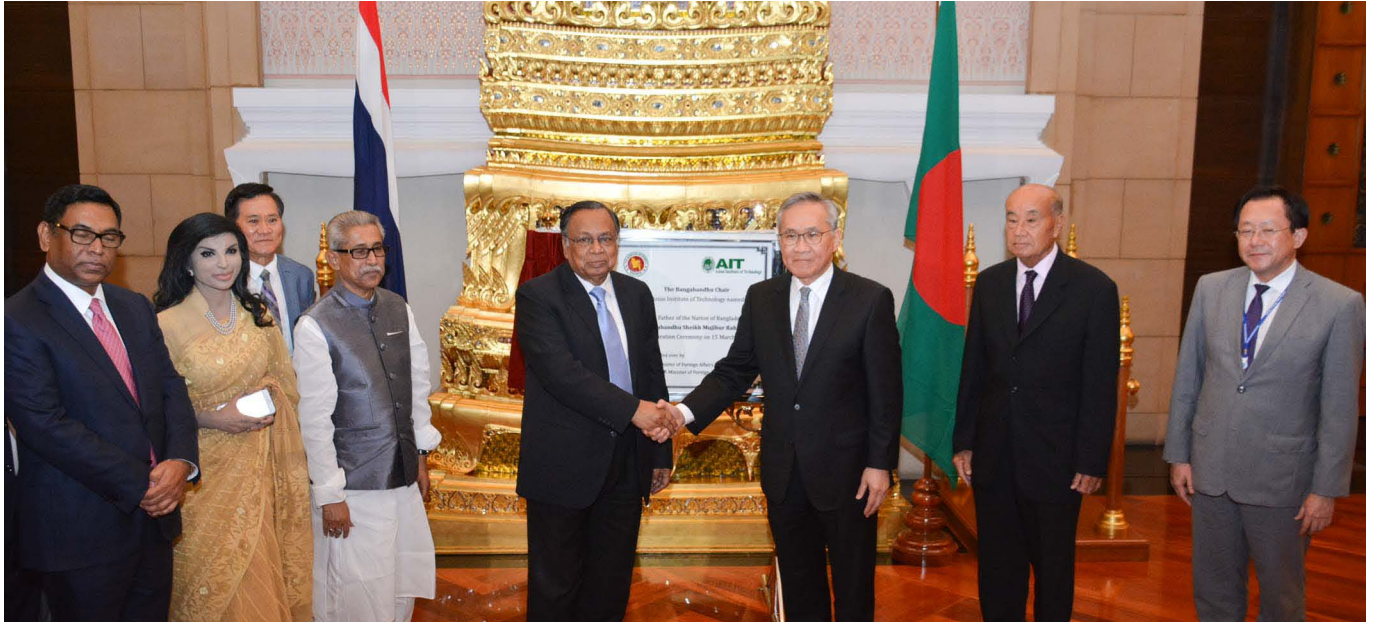
Foreign Minister of Bangladesh H.E. Mr. Abul Mahmood Ali, and Foreign Minister of Thailand, H.E. Mr. Don Pramudwinai jointly inaugurate the Bangabandhu Chair and unveil a commemorative plaque at the Ministry of Foreign Affairs.