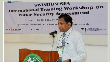
Workshop on Water Security Assessment