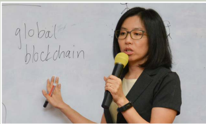
Seminar on Cryptocurrencies and Blockchain Research