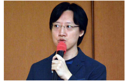
Seminar: Big Data Analytics in Practice