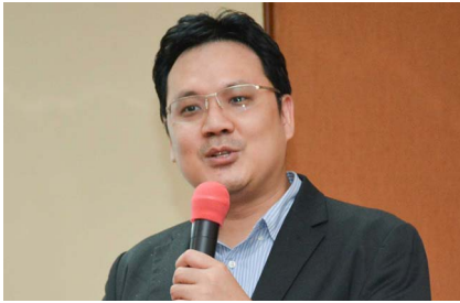
Seminar: Blockchain State of the Art and Novel Application.