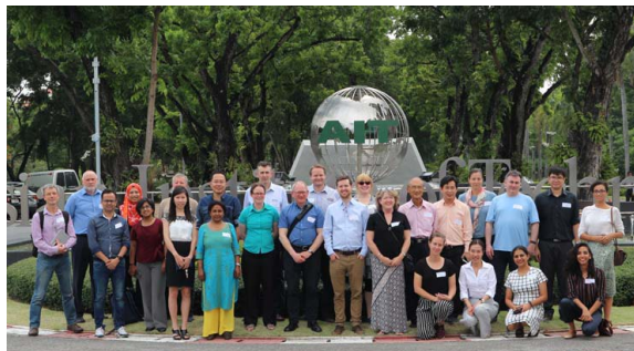
Workshop: Sanitation and Hygiene Equity (SHE) Hub