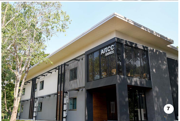
1, 3 Administration Building. 2 Coffee Shop. 4 Clock Tower. 5 New AIT Gate. 6 New AIT bus stop. 7 AIT Conference Center Annex.