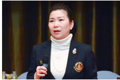
HR training on Excellence in Customer Service.