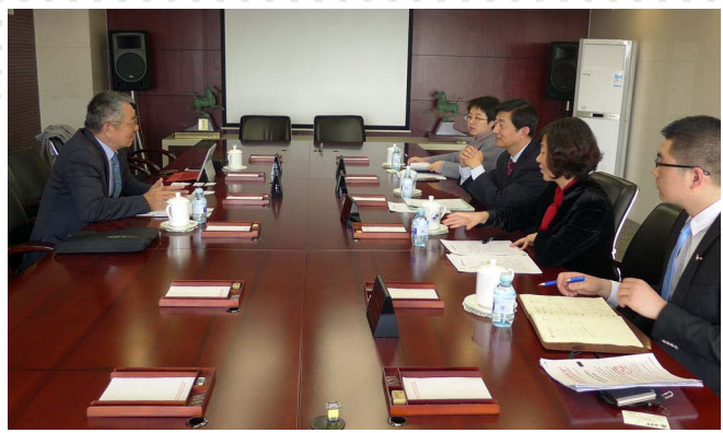
Meeting with the Secretary General of China Scholarship Council, Beijing.

At each university, the President described the mission and status of AIT, and laid out for the leadership