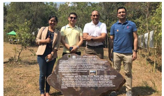
AIT Solutions Team in the Khao Yai National Park