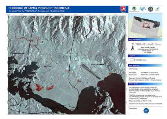
Red color depicts flooded areas.

AIT's Geoinformatics Center (GIC) has taken the lead in providing emergency maps following the flood that hit Indonesia's easternmost province of West Papua. Torrential rains caused widespread flash flooding and triggered landslides affecting mountainside villages. Initial estimates placed the number of those killed at over 100, with the worst landslides occurring in the city of Jayapura. GIC was the project manager following the activation of the Disaster Charter.