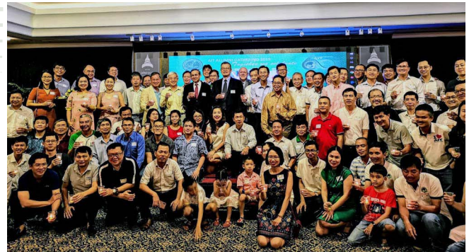
60th Anniversary Gala Dinner organized by AIT Alumni Association Viet Nam at Ho Chi Minh City.

logo will be on our AIT literature and significant programs during 2019.