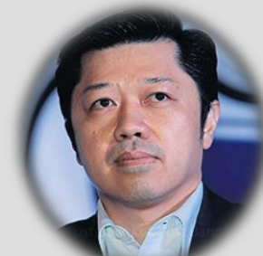
SUPHACHAI CHEARAVANONT: CEO CP GROUP