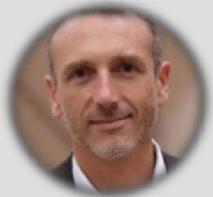
EMMANUEL FABER: CEO DANONE