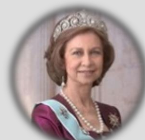
HER MAJESTY QUEEN SOFIA OF SPAIN