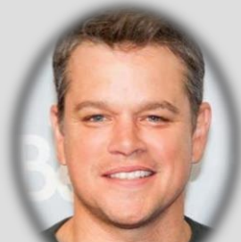
MATT DAMON: CO-FOUNDER WATER.ORG VIDEO GREETING