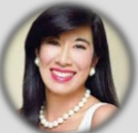
ANDREA JUNG: PRESIDENT GRAVEEN AMERICA & FORMER CEO AVON