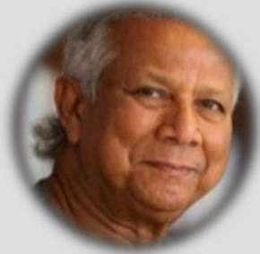
NOBEL LAUREATE PROF. MUHAMMAD YUNUS: FOUNDER GRAVEEN BANK