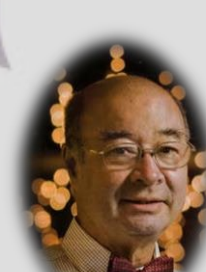
MECHAI VIRAVAIIDYA: CHAIRMAN MECHAI VIRAVAIIDYA FOUNDATION