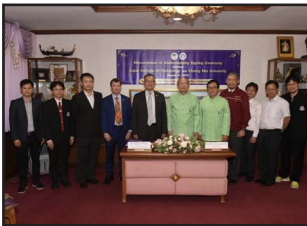
Chiang Mai University, Thailand 21 August 2019