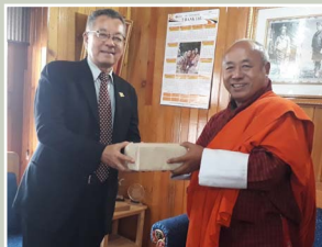
Meeting with Honorable Minister of Agriculture and Forests, and AIT Alumnus H.E. Yeshey Penjor on 8 August 2019.