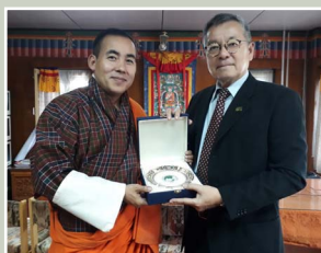
Meeting with Honorable Minister of Education Jai Bir Rai on 8 August 2019.