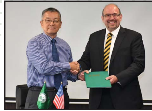
Double Degree Program with University of Iowa, USA 27 August 2019