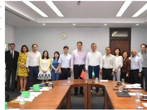
Delegation from RCEES