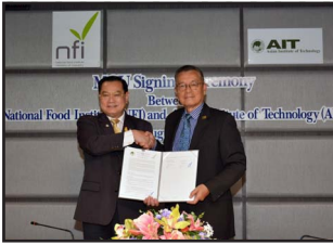
National Food Institute (NFI), Thailand 1 August 2019