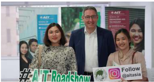
The 'AIT Roadshow' found its way to the downtown Bangkok campus on 29 February 2020. Student recruitment representatives offered advice to 36 prospective students on how to apply to AIT for the upcoming August 2020 semester. All applicants received a complementary English class and completed an English language entry test