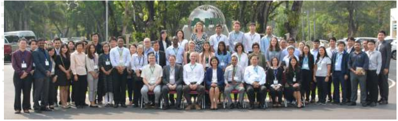
Joint Mid-Term Science and Stakeholder Workshop of "ENRICH: Enhancing Resilience to future Hydro-meteorological extremes in the Mun river basin in Northeast of Thailand" on 16 January 2020