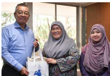
Delegates from the Universiti Brunei Darussalam paid a visit to AIT on 3 February 2020 to learn about alumni activities in AIT and to discuss potential tie-up.