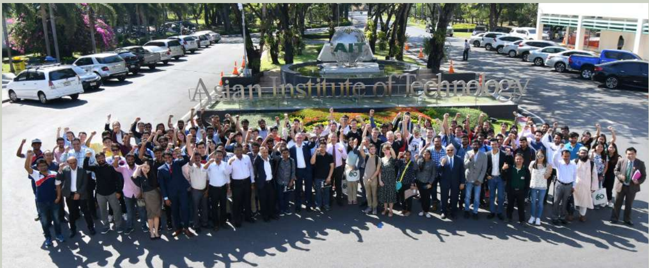
Orientation for the January Semester 2020 intake on 6 January 2020.