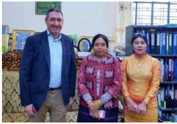
AIT Roadshow in Mandalay, Myanmar on 18 January 2020