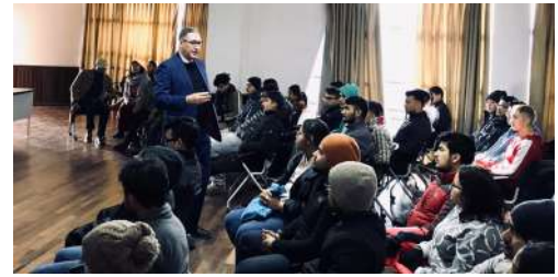
AIT Roadshow in Kathmandu, Nepal on 25 January 2020