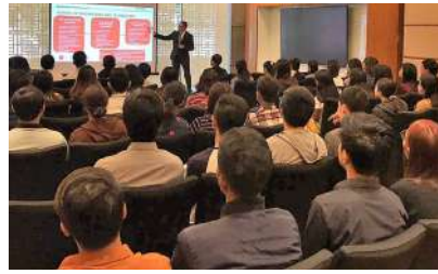
AIT Roadshow in Yangoon, Myanmar on 19 January 2020