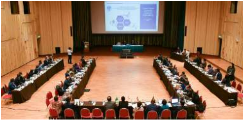
RIMES Council Meeting 2020 at AIT on 8 January 2020