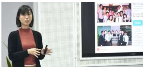
The annual seed acceleration program: TECH PLANTER in THAILAND 2020 on 23 January 2020

Special Lecture by University of Waterloo Computer Scientist