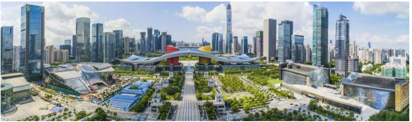
Shenzhen, a global technology hub in China

In order to continue to promote diversified cooperation under the auspices of the AIT Belt & Road Research Center, AIT has signed an MOU with DeepRock company of Shenzhen in launching a cooperation to foster connections between AIT and enterprises in Shenzhen. DeepRock was founded by renowned China entrepreneur Wang Shi, who founded in Shenzhen the internationally prestigious Vanke Development Company in the 1980s.