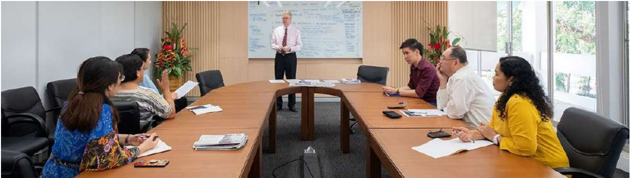
The AIT Coronavirus Task Force meets daily.