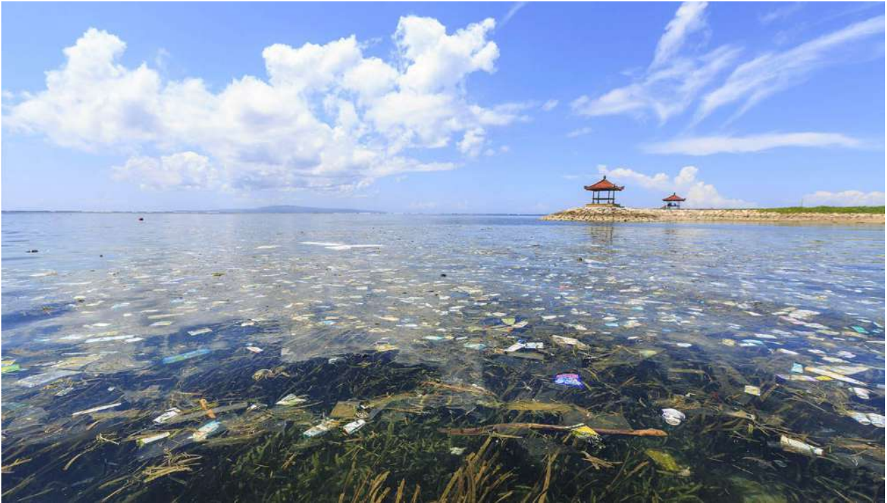
AIT launches specialized Marine Plastic Abatement MSc for August 2020.