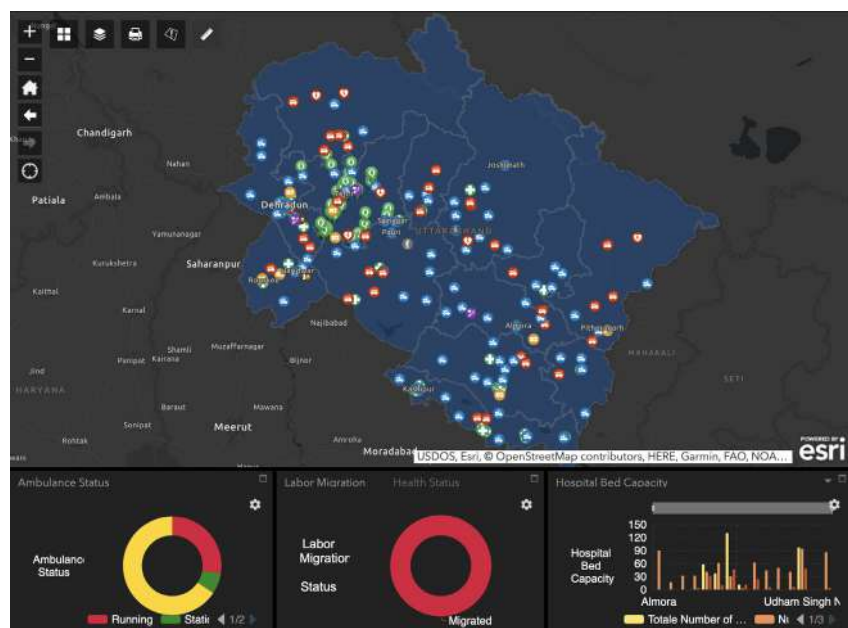
GIC's COVID-19 Decision Support System maps Uttarakhand, India using geospatial data and analytics.

The online platform and its data are also available to the Government officials in Uttarakhand, but non-sensitive information is expected to be made available to the public to provide situational awareness for citizens.