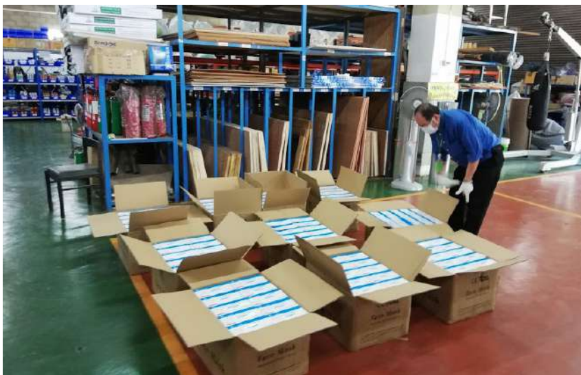
The director of OFAM inspects the shipment of face masks on April 20, 2020.

T hirteen hundred students, staff, and residents on AIT campus in late April received 10 free face masks each from an AIT Belt and Road Research Center donation of 20,000 masks.