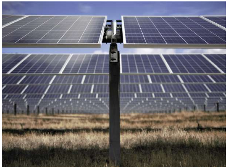
The new system could aid off-grid tracker solar deployment.

According to the research team, the system's XBee ZNet 2.5 module – a radio-frequency device developed to