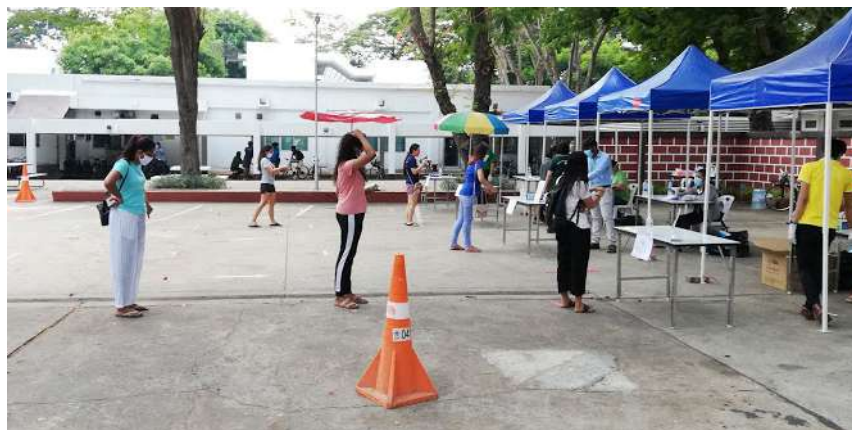
Students receive donated face masks on April 22, 2020.

The AIT Belt and Road Research Center supports research by our students and faculty which can benefit the entire Belt and Road region. It was inaugurated in November 2019, with funding by the AIT Chinese Alumni Chapter.