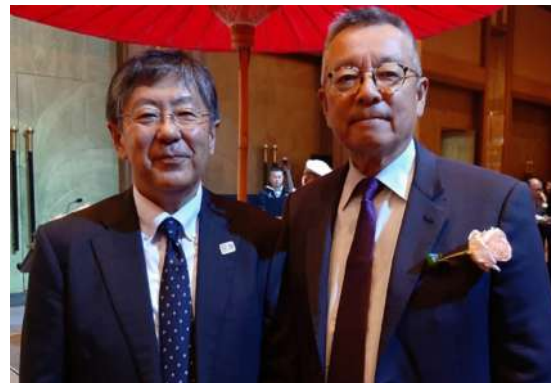
AIT President Eden Woon, right, with Japanese Ambassador Kazuya Nashida.

Plastic pollution is one of the greatest problems affecting the marine environment today. A staggering 8 million tons of plastic ends up in