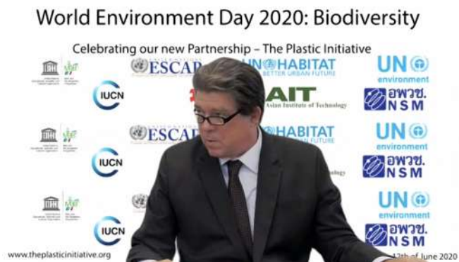
Dr. Benno Böer - Chief, Natural Sciences Section, UNESCO Bangkok office

AIT has joined UNESCO's newly unveiled 'The Plastic Initiative' along with Southeast Asian Ministers of Education Organization (SEAMEO), UN-Habitat, United Nations Economic and Social Commission for Asia and the Pacific (UNESCAP), International Union for Conservation of Nature (IUCN), National Science Museum (NSM), Thailand and the United Nations Environment Programme (UNEP).