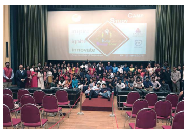
Education Camp and Study Tour for United Group of Institutions, India 15-29 July 2019