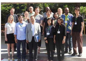
Inception Workshop on Monitoring, Evaluation, and Learning for the World Conservation Monitoring Centre (WCMC) Trade Hub Project 28 July – 1 August 2019