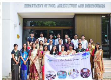
Summer School Program for Assam Agricultural University, India 22 July - 10 August 2019