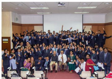
Education Camp and Study Tour for Students from JIS Group Educational Initiatives, India 1-15 July 2019