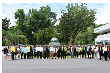
Effective Faecal Sludge Planning to Minimize Environment Pollution and Protect Public Health 31 July 2019