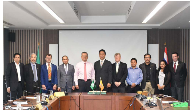
MoU signing ceremony between AIT and CDCL.