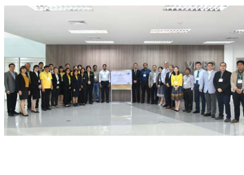
National Consultation Workshop on Eco-Friendly Water Management for Sustainable Wetland Agriculture 25-26 July 2019