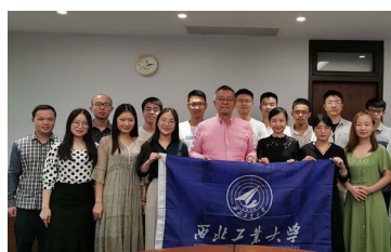
Summer Camp for Northwestern Polytechnical University, China 22-29 July 2019