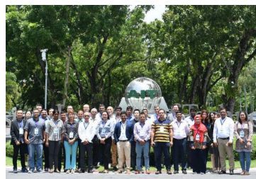
Asia Pacific School on Internet Governance 7-10 July 2019